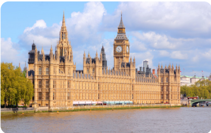
Houses of Parliament

London is a city. It is the largest settlement in the United Kingdom. Over eight million people live there. The River Thames is the main river that runs through the city. Tourists visit London to shop and see its famous landmarks.