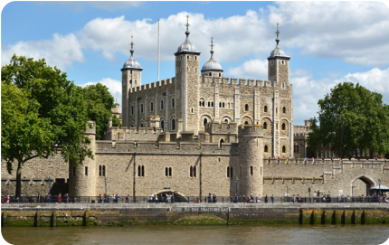
Tower of London