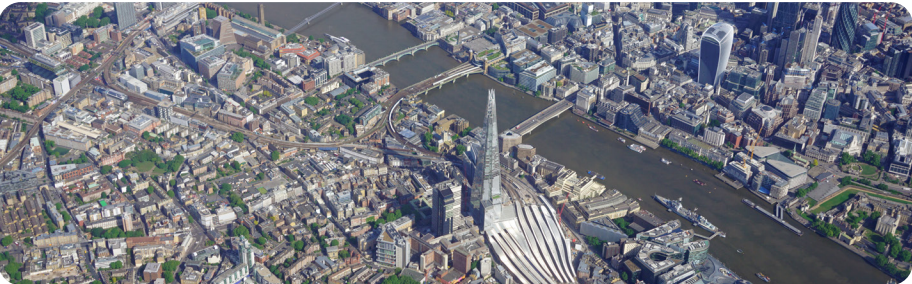
Aerial view of London

A city is a large, busy settlement where lots of people live and work. A city usually has a cathedral, a river, important buildings and offices where people work. There are lots of things to see and do in a city. There are many shops and restaurants to visit.