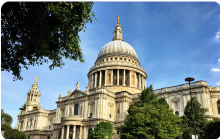
St Paul's Cathedral